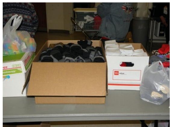
The Auxiliary & Detachment donated $600 to give gifts of gloves, socks and hats for our veterans.