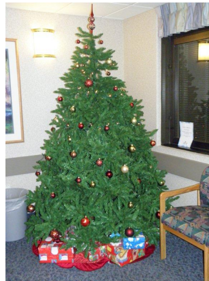
Spirits were high because of our decorating crew and the trees. One in the Hospice Unit & the other upstairs in the main hospital.