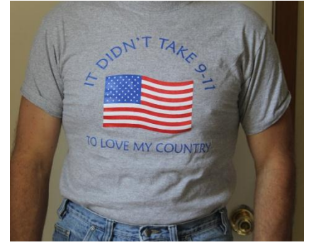
This is the new flag shirt Get yours now! $15.00.