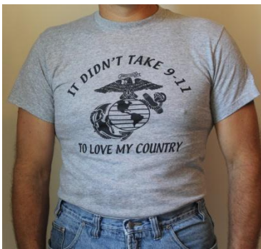
The short sleeve version.