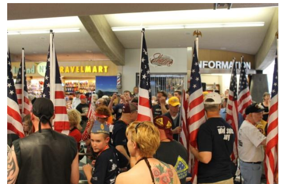
It was a packed airport for the last honor flight.