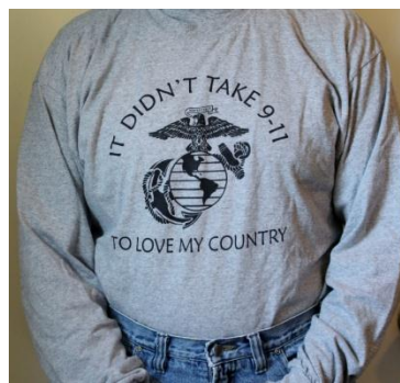
The long sleeve version $18.00.